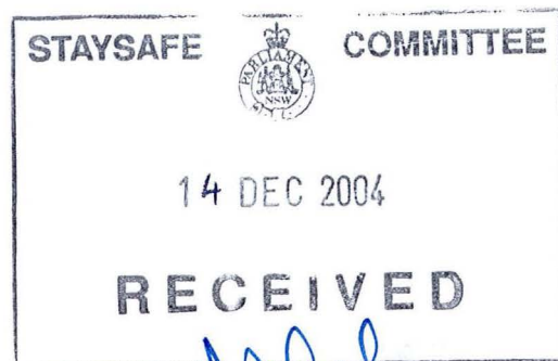
John Watkins MP Minister for Police - 8 DEC 2004